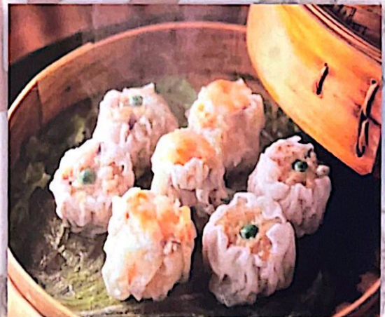
1 Dozen Beef /Pork Chicken Snacks R155