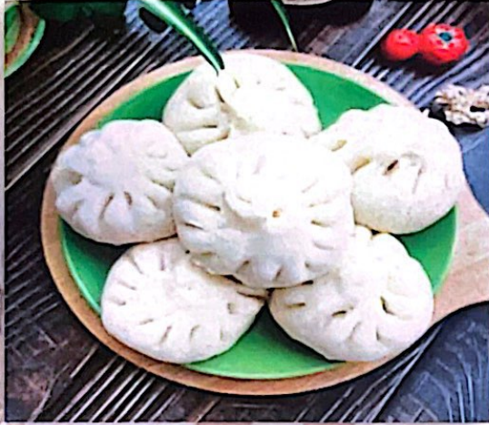
1/2 Dozen Chicken & Mushroom Buns R100