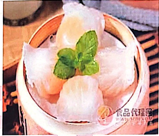
1 Dozen Prawn Dumpling R190